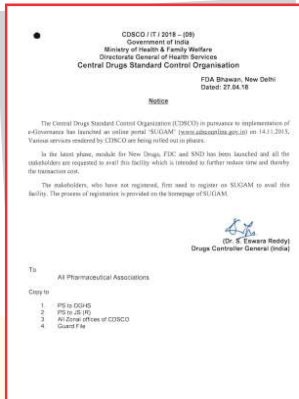
Announcement of module for New Drugs, FDC and SND on SUGAM Website of CDSCO dated 27 th April 2018